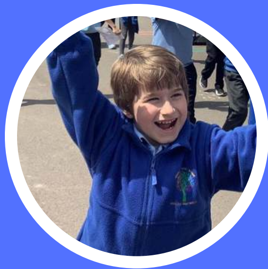
Health and Well-being