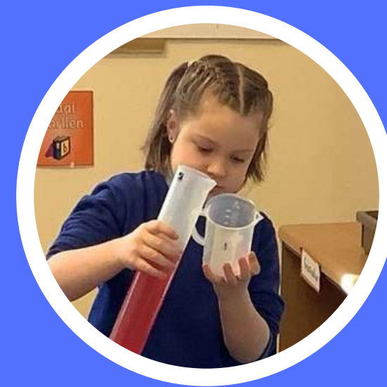
Mathematics and Numeracy