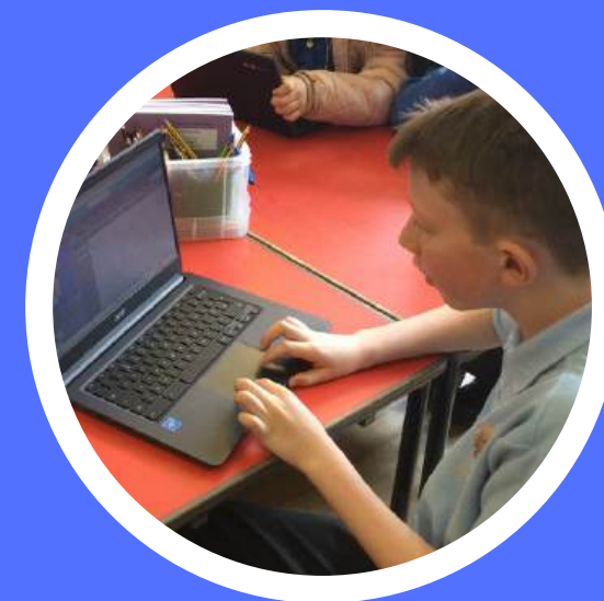
Languages, Literacy and Communication

Our curriculum provides learning which links to the six areas of learning and experience.