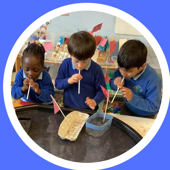
Science and Technology